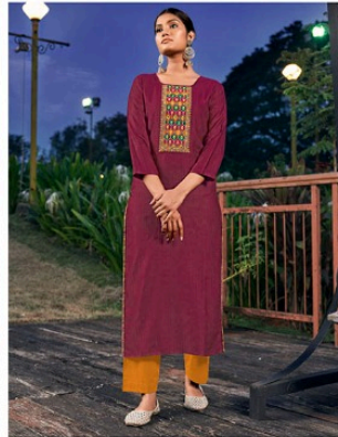
{ 3.3.6.4 }