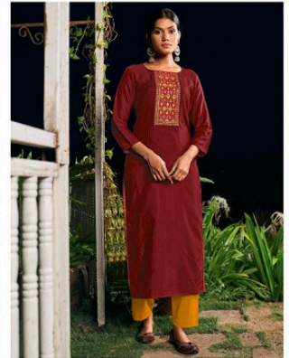
{ 3.3.6.8 }