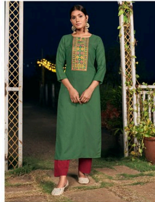
{ 3.3.6.7 }