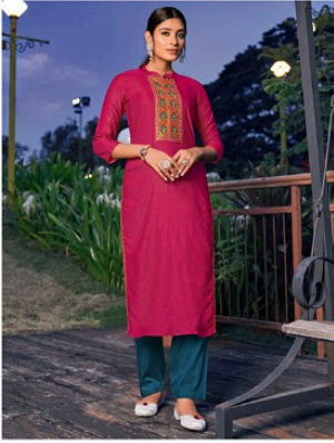
{ 3.3.6.1 }