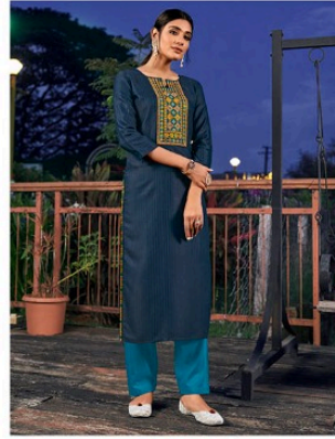
{ 3.3.6.5 }