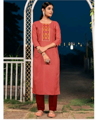
{ 3.3.6.6 }