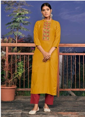
{ 3.3.6.3 }