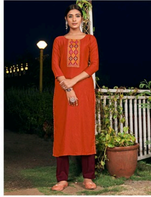
{ 3.3.6.2 }