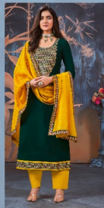
D. NO. 11734