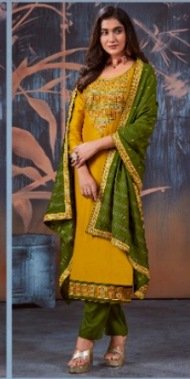
D. NO. 11732