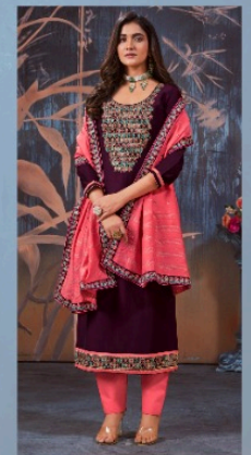
D. NO. 11735