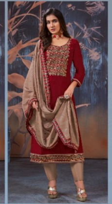
D. NO. 11733