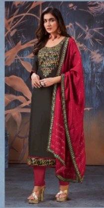
D. NO. 11731