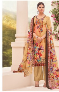
code | 706