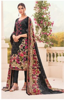
code | 702