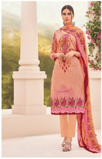
code | 701