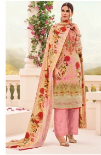
code | 710