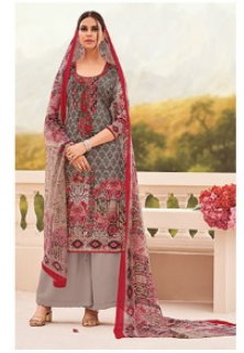
code | 708