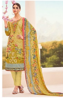
code | 703