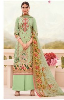
code | 707