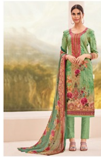
code | 705