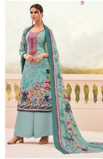
code | 709