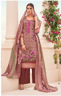
code | 704