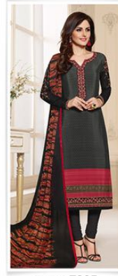
STYLE NO. 7905