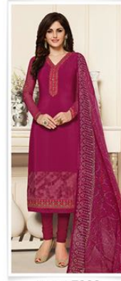
STYLE NO. 7906