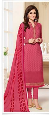
STYLE NO. 7904