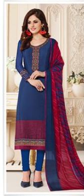
STYLE NO. 7910