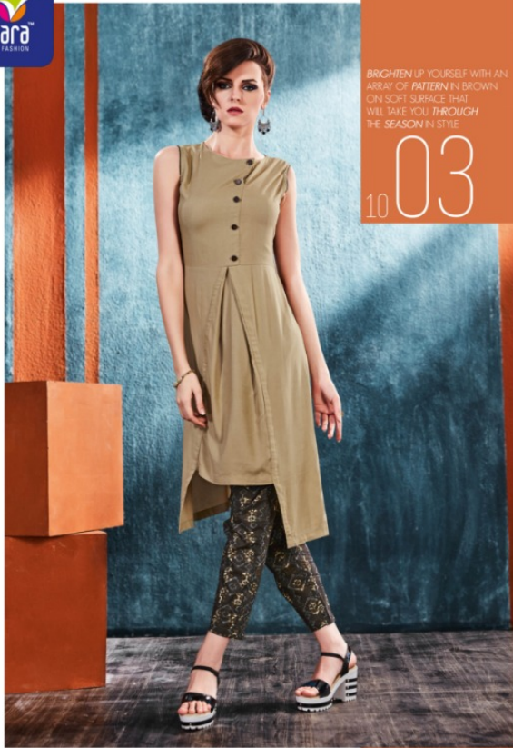
SAUNT THROUGH THE SEASON IN STYLE WITH BROWN PRINTED BRIGHTEN UP YOUR MOOD.

BRIGHTEN UP YOURSELF WITH AN ARRAY OF PATTERN IN BROWN ON SOFT SURFACE THAT WILL TAKE YOU THROUGH THE SEASON IN STYLE