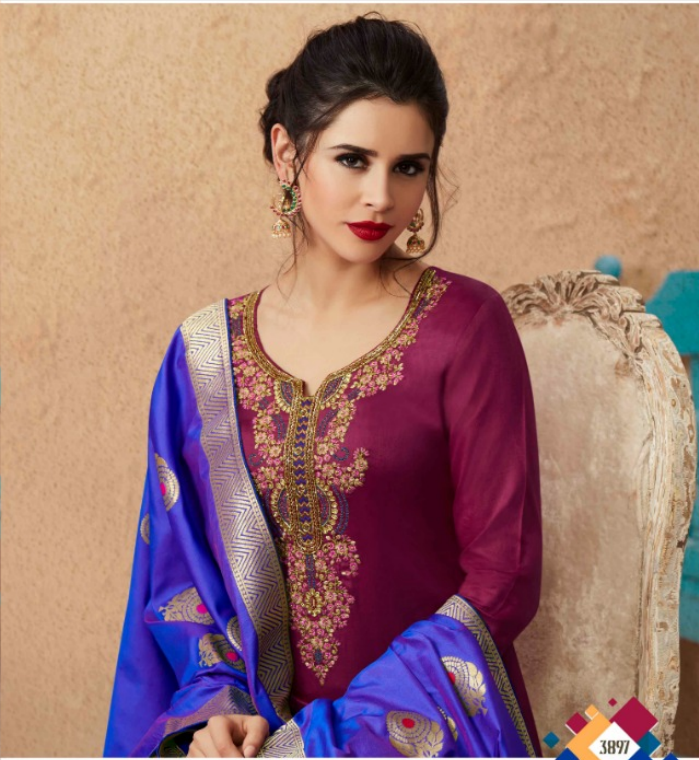
6. As the season of festivities knocks on our doors, get ready with the most amazing festive attires.