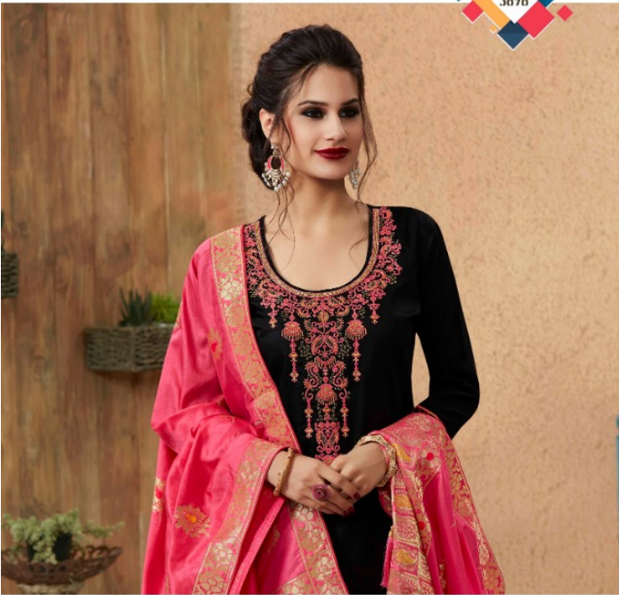
Up your fashion game with grace and style adorning fine designed dresses embellished with delicate work.