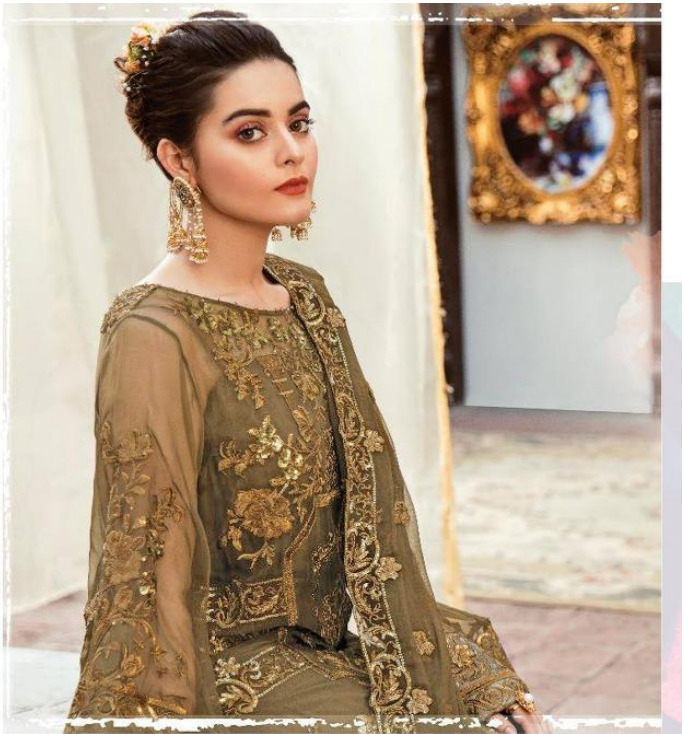
"I like my money right where I can see it...hanging in my closet."