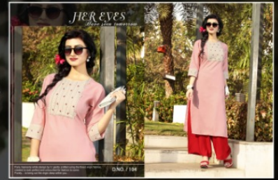
D.NO. / 104