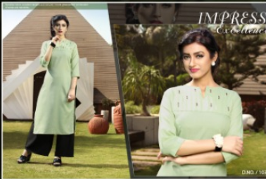
D.NO. / 103