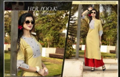
D.NO. / 106