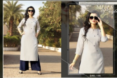
D.NO. / 105