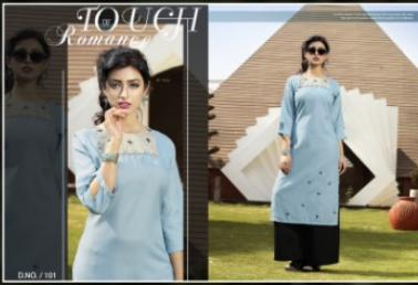
D.NO. / 101