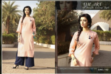
D.NO. / 102