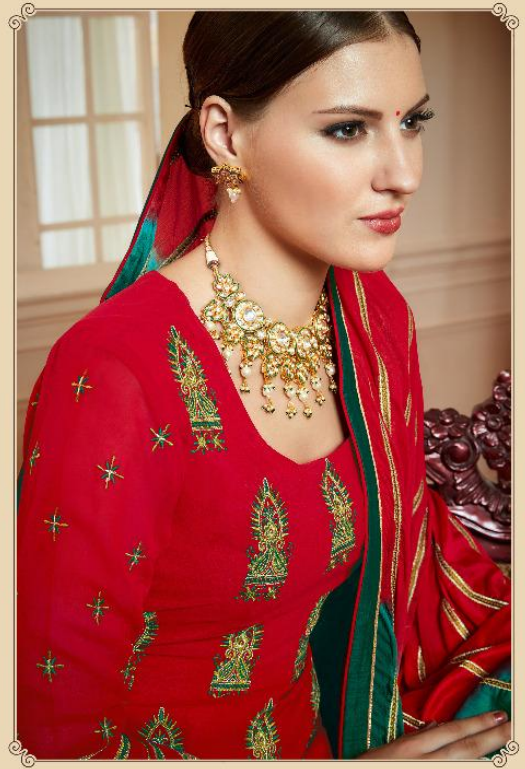
Dark Glamour D.No. 1031