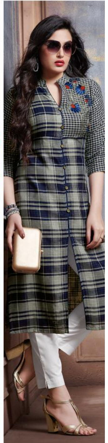
STYLE - 1265