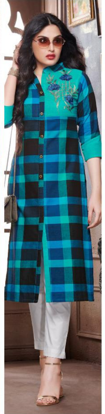
STYLE - 1261