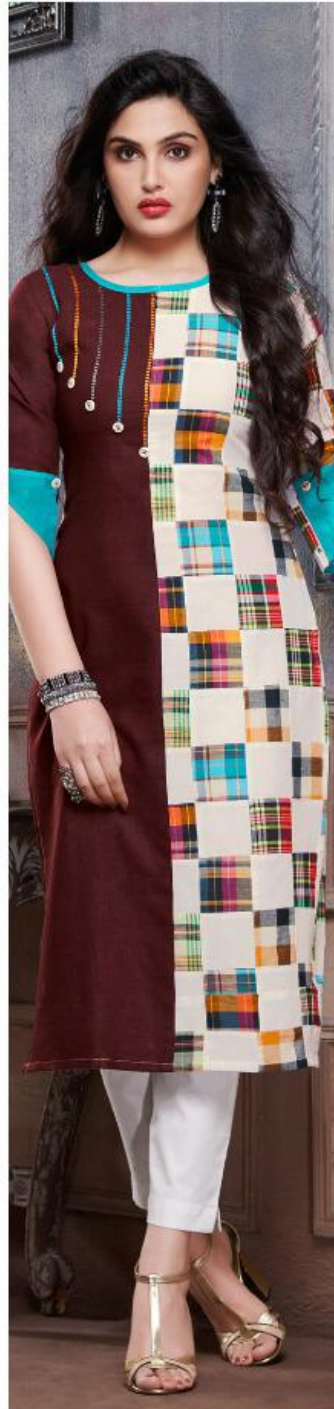
STYLE - 1264