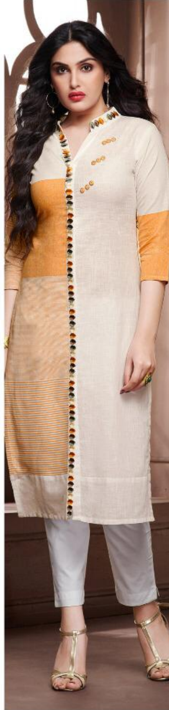
STYLE - 1259