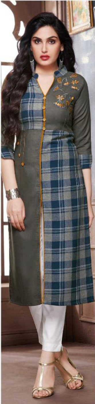
STYLE - 1262