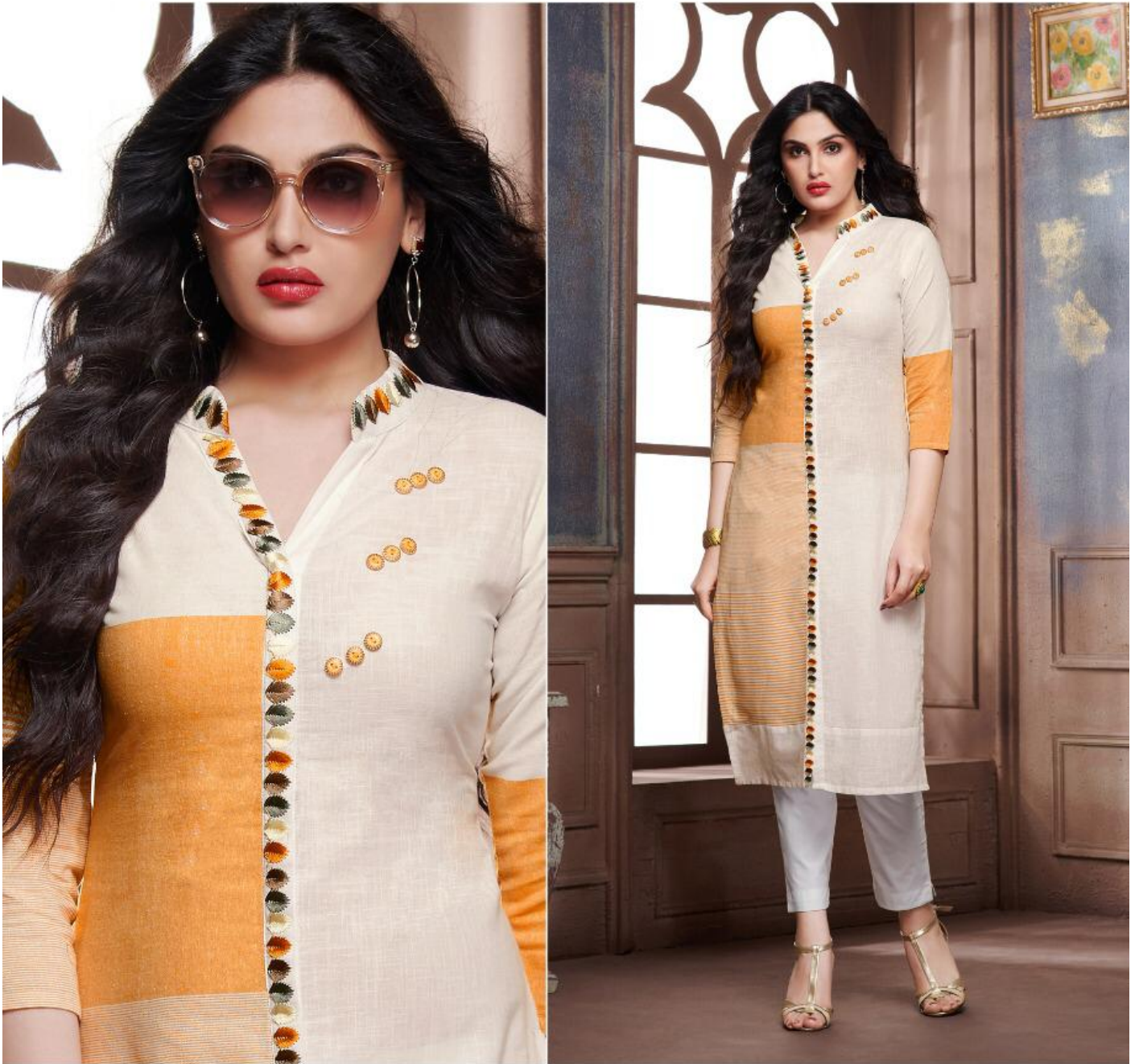
STYLE - 1259