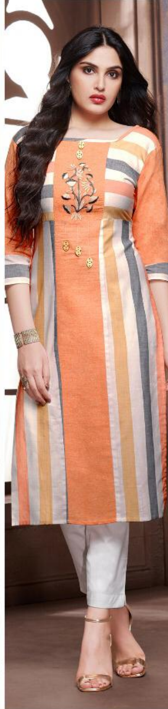
STYLE - 1260