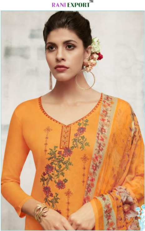
The rich vibrant dyes are an emblem of folk art and a memory, orange shawl with a floral border.