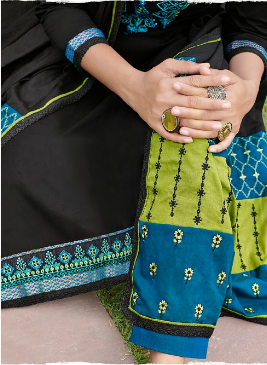
different cultures come together in a tribute to fashion's biggest moment this season.