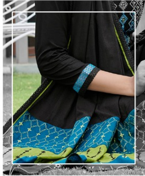
fashionable tributes to color & silhouettes that have inspired trends around the world!