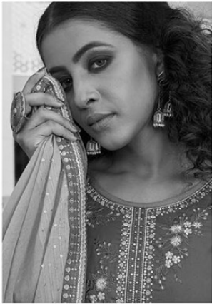
Earthy tones & natural FABRICS MAKE FOR SOFT CLASSIC look to your beauty