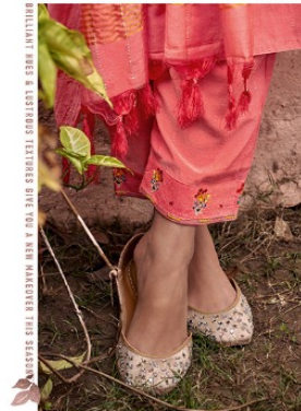
BRIGHT PINK & CORAL TONES ARE THE NEW MUST-HAVE FOR SEASON